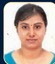
Roshini Selvakumar School of Excellence