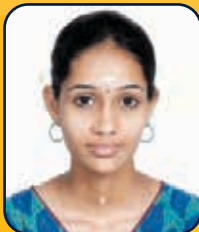
R. Meenakshi Ethiraj College