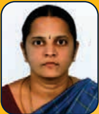
B.S. Lakshmi Meenakshi College