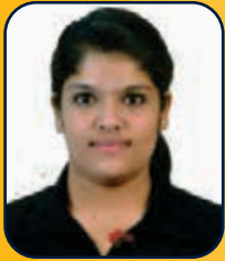
Thaniya Sagar School of Excellence