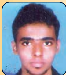
Adil Aman Govt. Model Sr. Sec. School Portblair