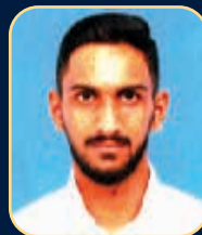
M.V. Vishal Sundar School of Excellence