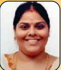
Shrimathi Indira Gandhi College, Trichy